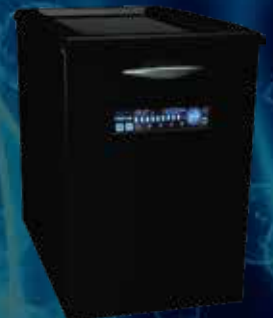
SYNEXIS® OMNIA SENTRY (STANDALONE)

Effective against every species of dry microbe and insect on which it has been tested, including: